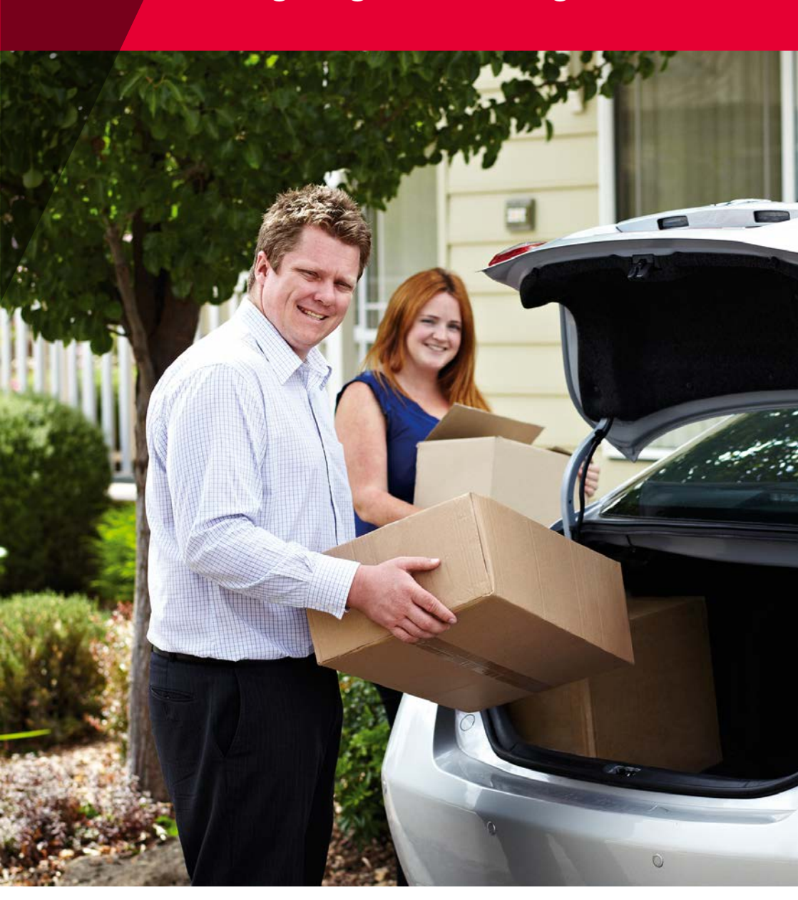
PART 4: Leaving a tenancy after giving or receiving notice